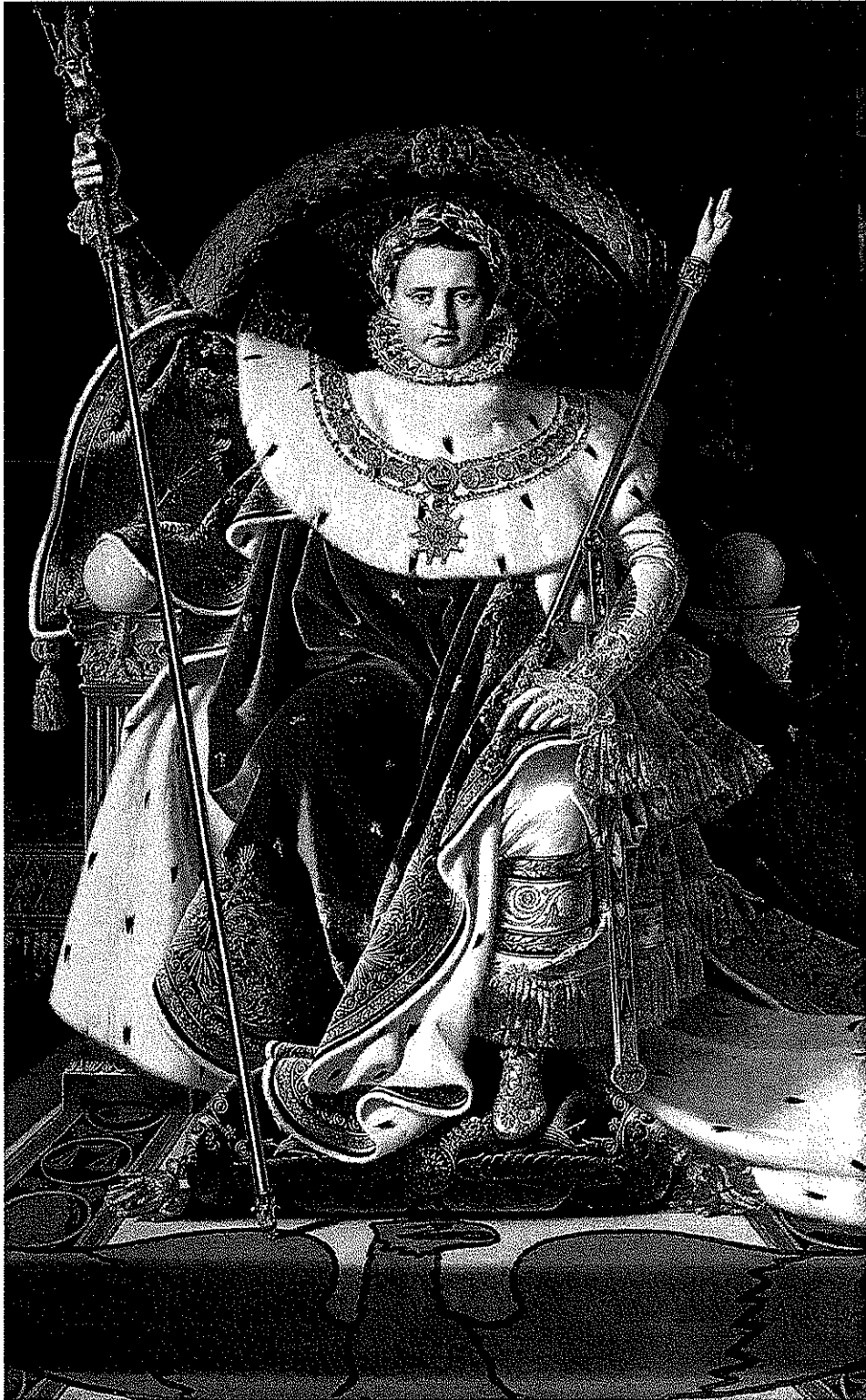
Figure 4 Napoleon Bonaparte on his Imperial Throne by Auguste Dominique Ingres (Google Images)

( http://www.powellhistory.com/art/history_in_art_NapoleonGallery.html )