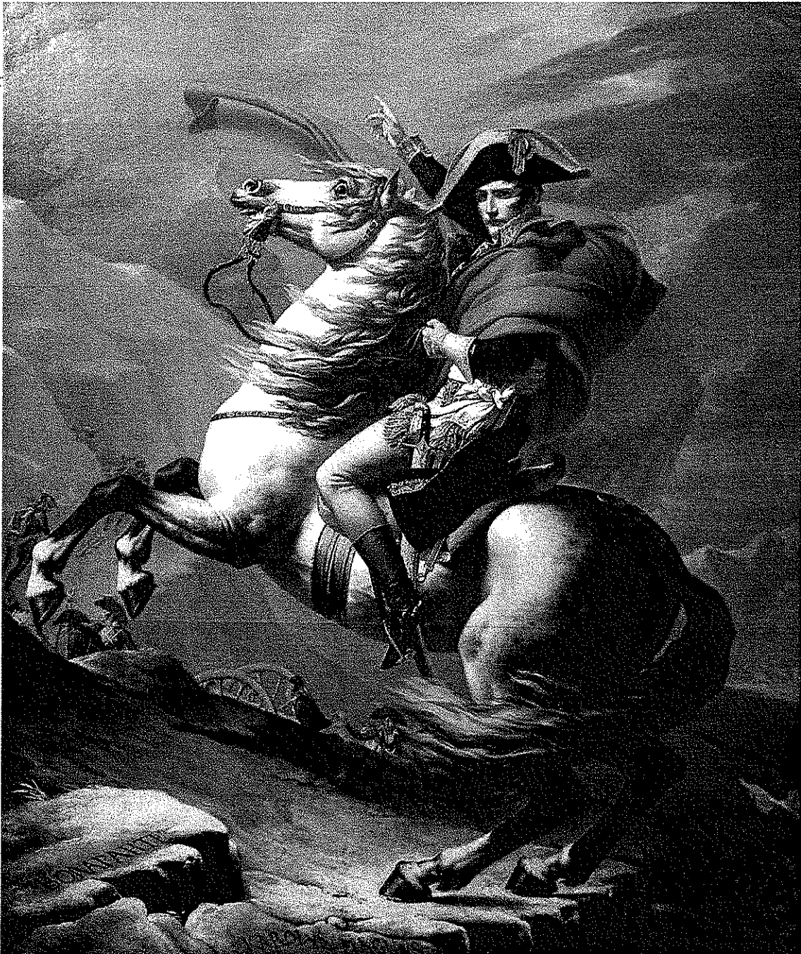
Figure 2 Napoleon at the Saint-Bernard Pass by Jacques-Louis David

( http://www.tate.org.uk/tateetc/issue9/artistemperor.htm )